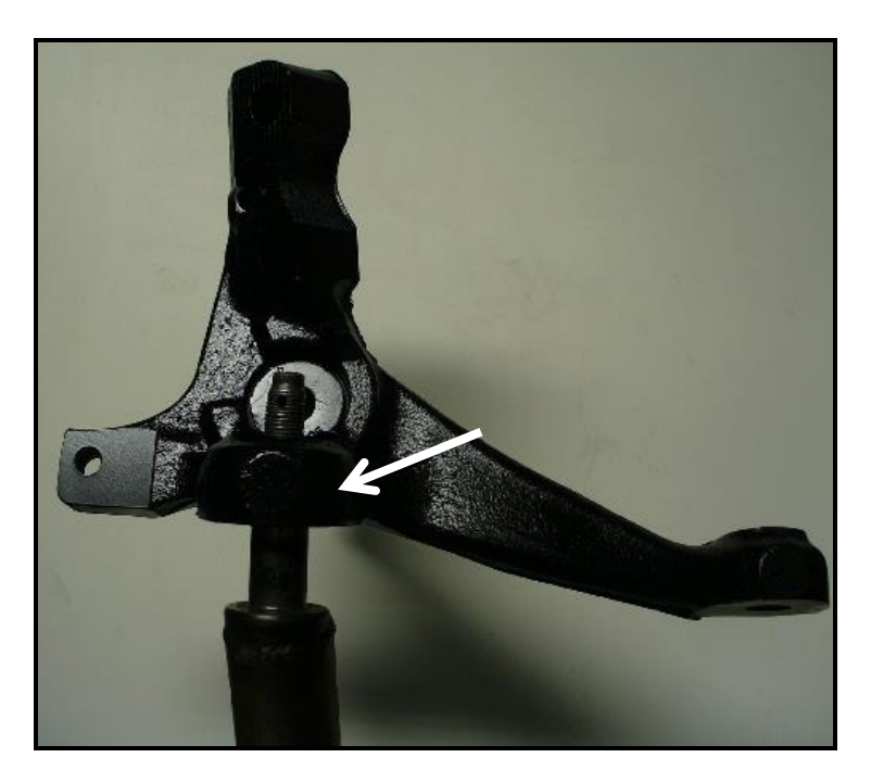
Strike here to dislodge ball joint

3. Strike the spindle at the ball joint boss to dislodge the ball joint. When the lower is loose, support the lower arm with a floor jack, remove the bolts retaining the strut to the spindle. Lift the spindle off of the lower ball joint and set aside. This is a good time to check the ball joints and tie rods for replacement, if necessary. See photo below for reference of ball joint location: