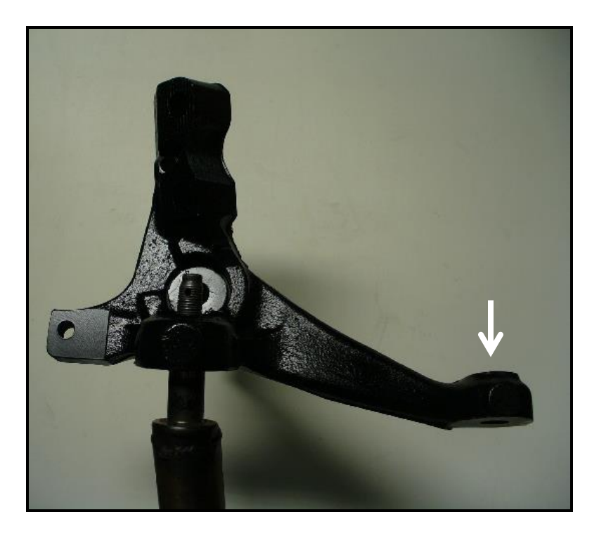
Strike tie rod end boss here with large hammer