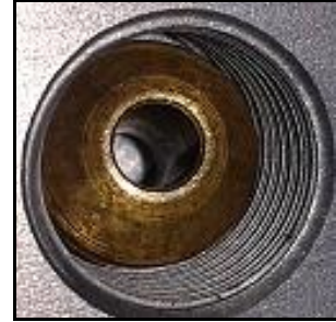
Figure 1: Supplied brass inserts Figure 2: Correctly installed Figure 3: Incorrectly installed

NOTE: Notice the exposed thread difference between a correctly and incorrectly installed insert.