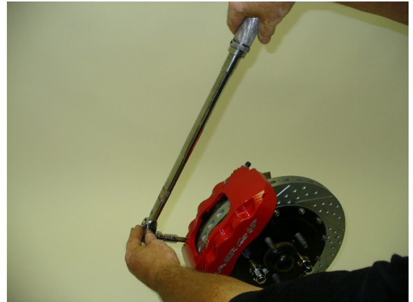
Torque allen bolts to 85 ft-lbs.

With pads in place, install the correct side caliper (bleeder screw pointed up) on the intermediate bracket. Install the supplied allen bolts and torque to 85 ft-lbs.