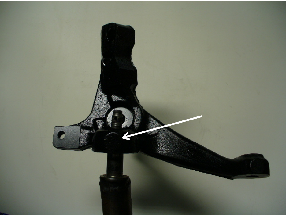
Strike here to dislodge ball joint.

Strike the spindle at the ball joint boss (see photo below) to dislodge the ball joint. When the lower is loose, support the lower arm with a floor jack, remove the bolts retaining the strut to the spindle. Lift the spindle off of the lower ball joint and set aside.