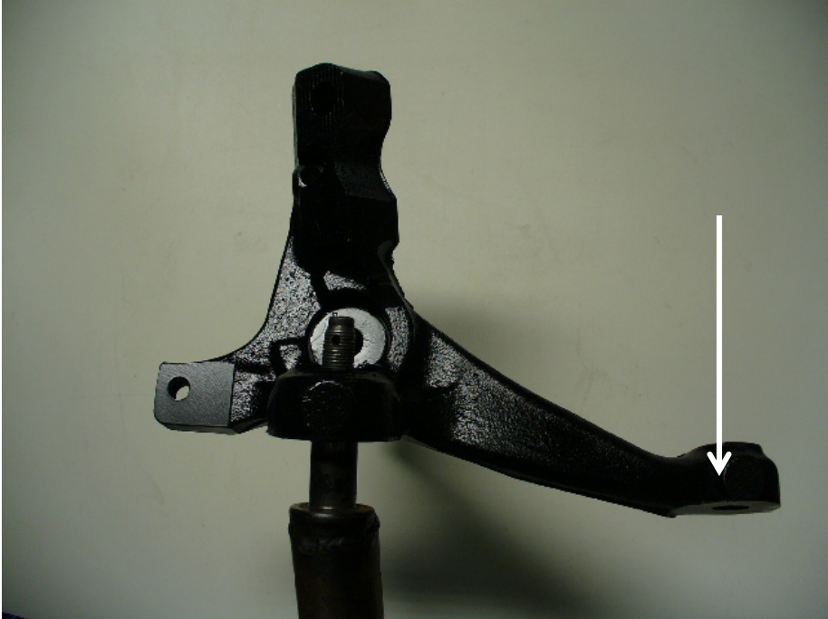
Strike tie rod end boss here with large hammer.

With a large (4 lb) hammer, strike the spindle at the tie rod end boss (see photo below for area to strike) to dislodge the tapered pin. Do not use a pickle fork as this will destroy the boots. Remove the nut and swing the tie rod out of the way.