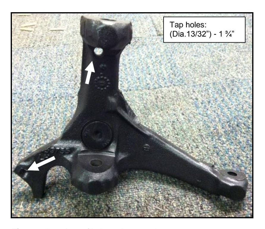
Figure 3: Locations of holes to be tapped

5. With the spindle removed from the vehicle, it will need to be modified before installing the new brake system. Figures 3 and 4 depict this modification: