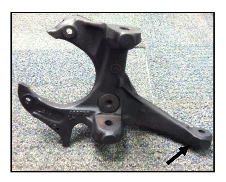
Figure 1: Strike tie rod end boss here with large hammer

4. Strike the spindle at the ball joint boss (see Figure 2 on continued page) to dislodge the ball joints. When the lower is loose, support the lower arm with a floor jack, strike the top and remove the nuts. Lift the upper control arm up and out of the way and lift the spindle off of the lower arm.