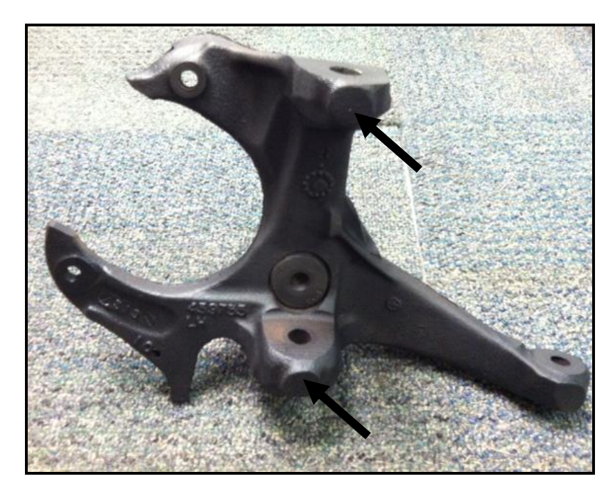
Figure 2: Strike here to dislodge ball joints

**Note: This is a good time to check the ball joints and tie rods for replacement if necessary.